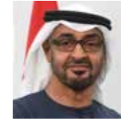
MOHAMMED BIN ZAYED AL NAHYAN