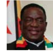
EMMERSON DAMBUDZO MNANGAGWA President of Zimbabwe