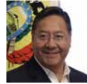
LUIS ALBERTO ARCE CATACTORA President of Bolivia