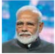
NARENDRA MODI Prime Minister of India