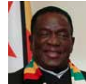
EMMERSON DAMBUDZO MNANGAGWA President of Zimbabwe