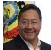
LUIS ALBERTO ARCE CATACTORA President of Bolivia